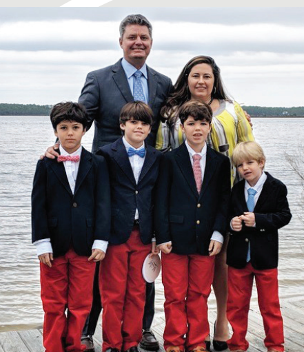
The Athey Family Whitfield (6th), Worth (6th), Mac (4th), Reddoch (2nd)

To pledge and/or give online visit: www.givetostlukeschool.com